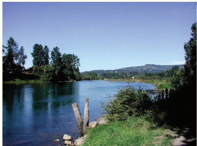
Lewis River, Woodland, WA

The source of Woodland's water supply is the aquifer beneath the North Fork of the Lewis River. The water collection system, called a horizontal collector well, is located below the river bottom and is relatively safe from any potential contamination or flooding damage which may take place in the river. The Lewis River watershed is fed by glacier melt from Mt. Adams and smaller tributaries such as Cedar Creek. The Lewis River is one of the cleanest and most pristine rivers in the region; however, the source is naturally high in iron.