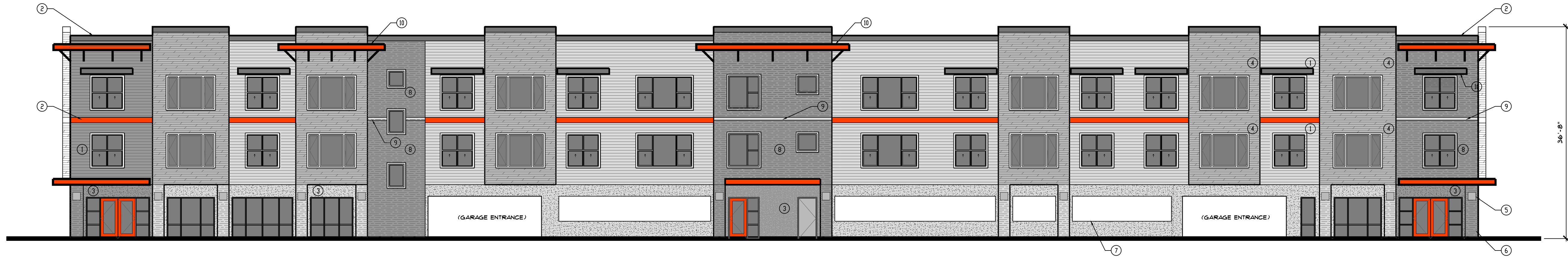
3 REAR ELEVATION A3