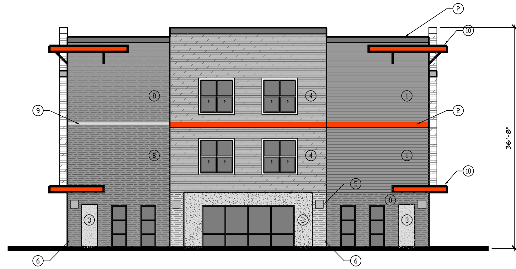
4 LEFT SIDE ELEVATION A3