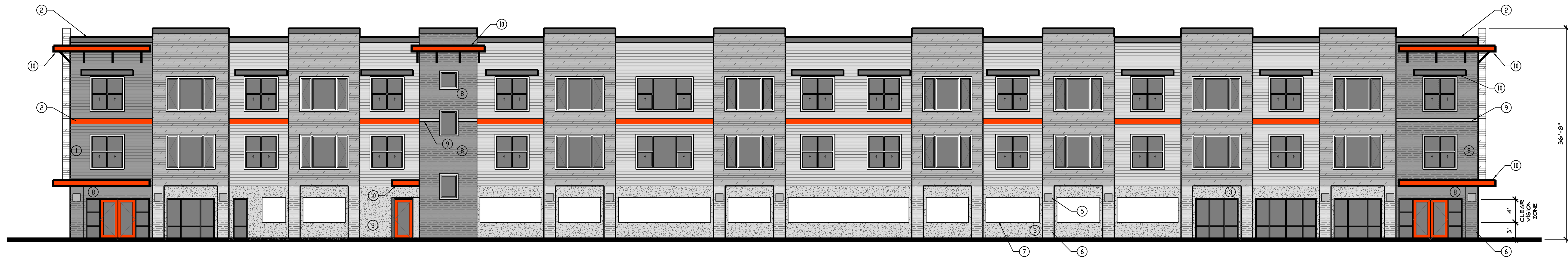
1 FRONT ELEVATION A3