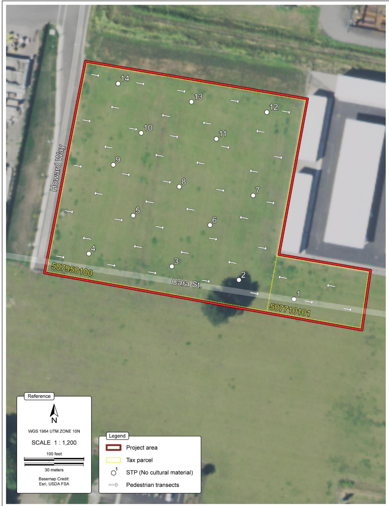
Figure 2. Aerial photomap showing the project area, shovel test probes (STPs), and pedestrian transects.