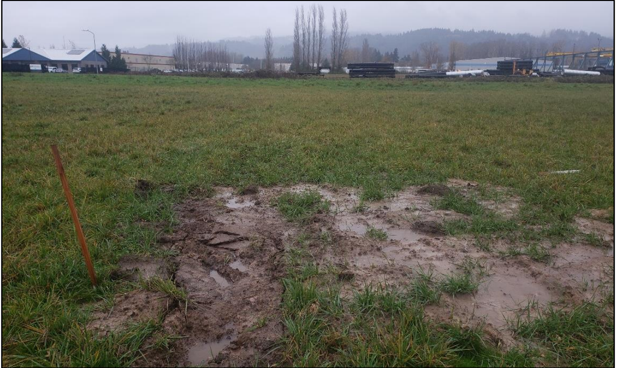
Figure 4. View looking north showing a backfilled geotechnical test pit.