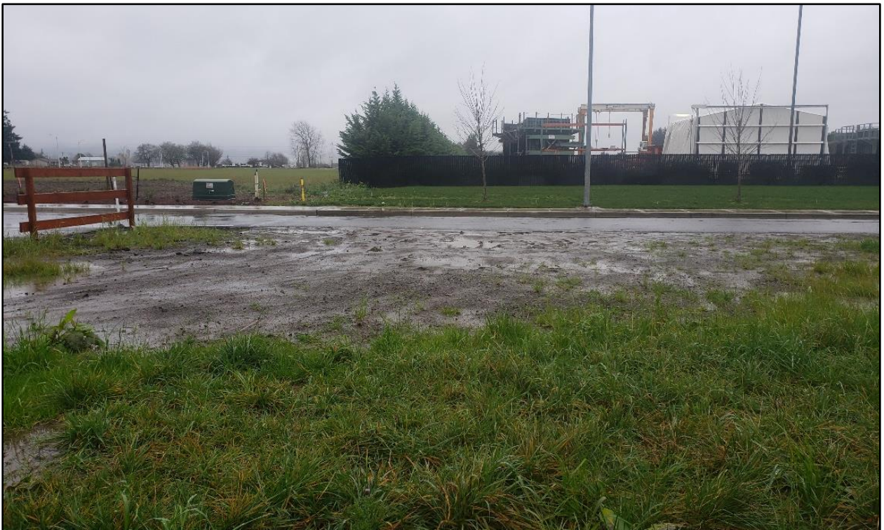
Figure 5. View looking west of the gravelled parking area in the southwestern part of the project area.