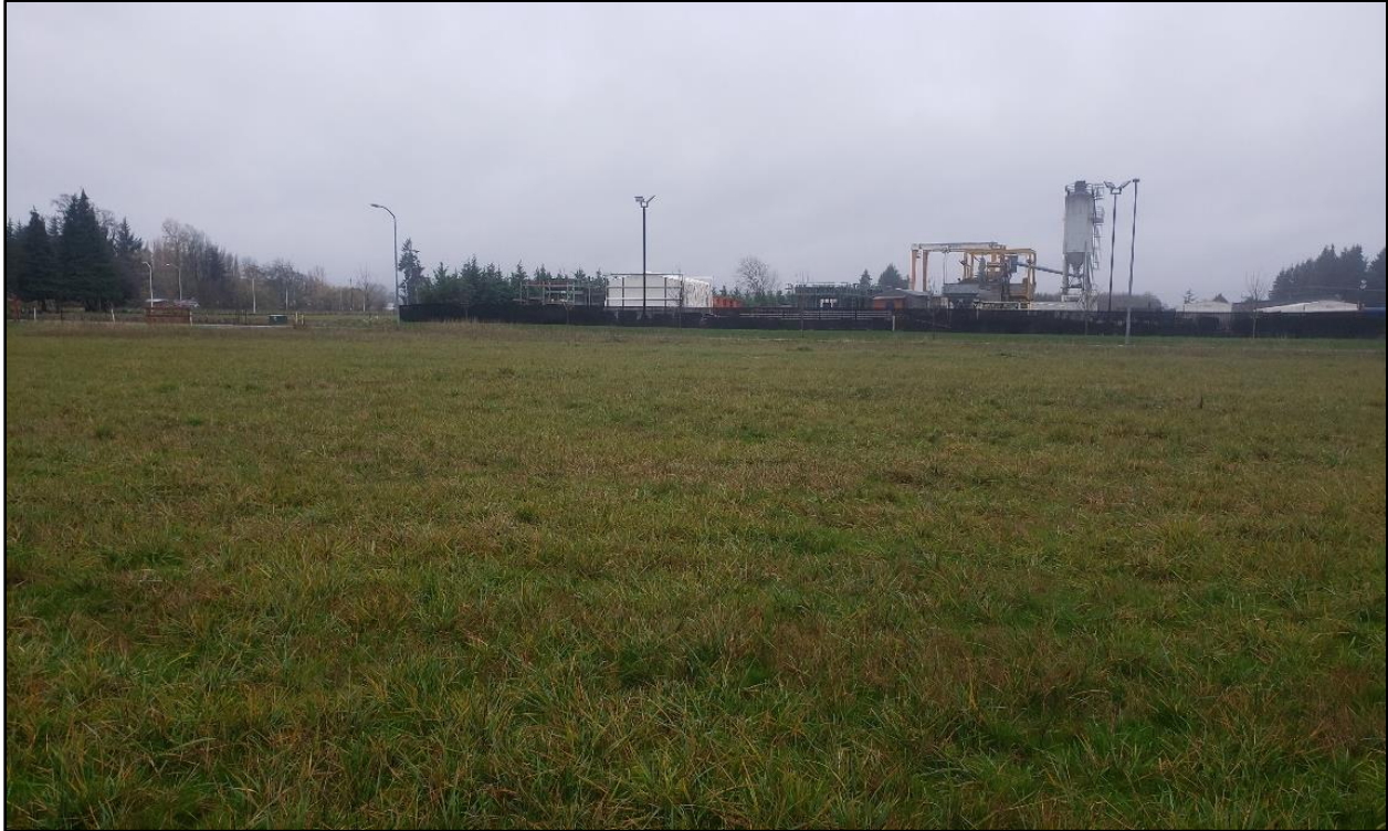
Figure 3. View looking northwest showing typical vegetation and flat topography in the development site.

project's Lead Archaeologist, prepared a letter describing the proposed developments and AAR's field methods for the study. The letter was supplemented with maps showing the project area's location and the configuration of the development footprint. It was distributed for review on November 2, 2021, to the Confederated Tribes of Grand Ronde Community of Oregon, the Cowlitz Indian Tribe, the Confederated Tribes of the Warm Springs Reservation, the Confederated Tribes and Bands of the Yakama Nation, and the Squaxin Island Tribe. Cultural resources staff from the Confederated Tribes of the Grande Ronde and the Squaxin Island Tribe responded to say that at present they had no concerns for the project area. No other comments were received.