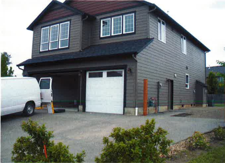
REAR VIEW (06/03/13)