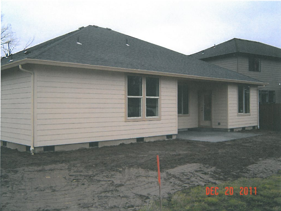
NORTHWEST SIDE (12-20-11)

If submitting more photographs than will fit on the preceding page, affix the additional photographs below. Identify all photographs with: date taken; "Front View" and "Rear View"; and, if required, "Right Side View" and "Left Side View."