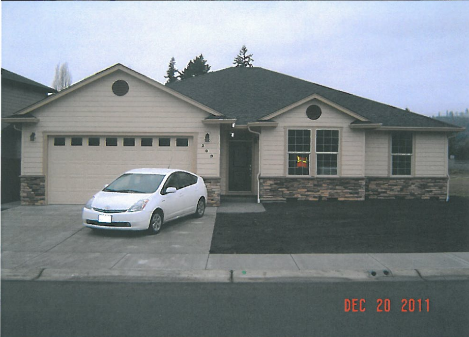
SOUTHEAST SIDE (12-20-11)

If using the Elevation Certificate to obtain NFIP flood insurance, affix at least two building photographs below according to the instructions for Item A6. Identify all photographs with: date taken; "Front View" and "Rear View"; and, if required, "Right Side View" and "Left Side View." If submitting more photographs than will fit on this page, use the Continuation Page, following.