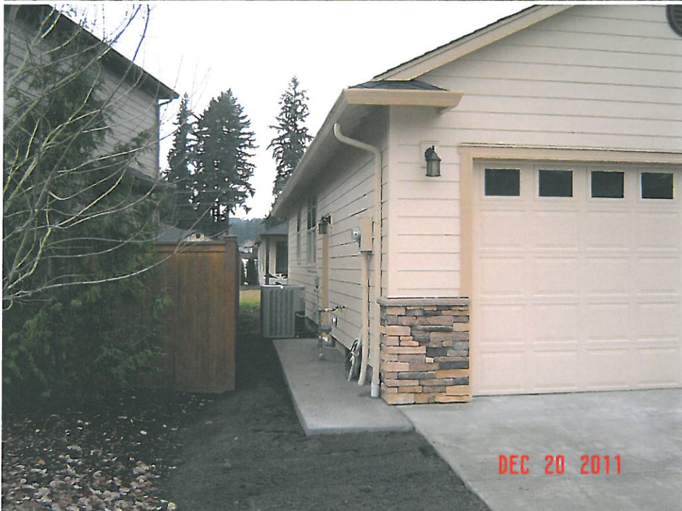
SOUTHWEST SIDE (12-20-11)