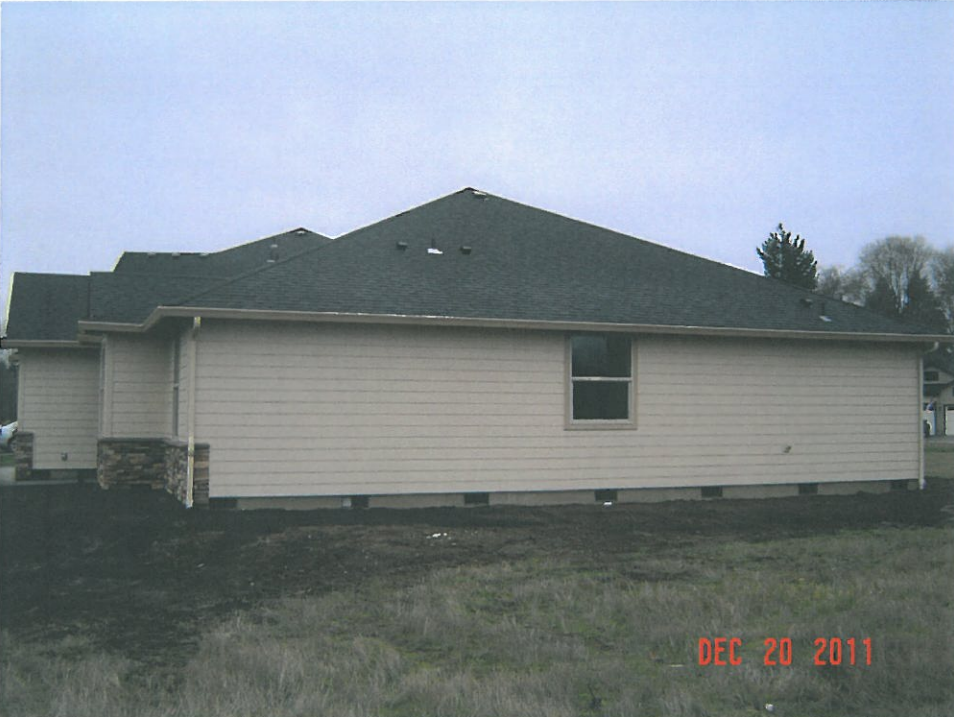
NORTHEAST SIDE (12-20-11)