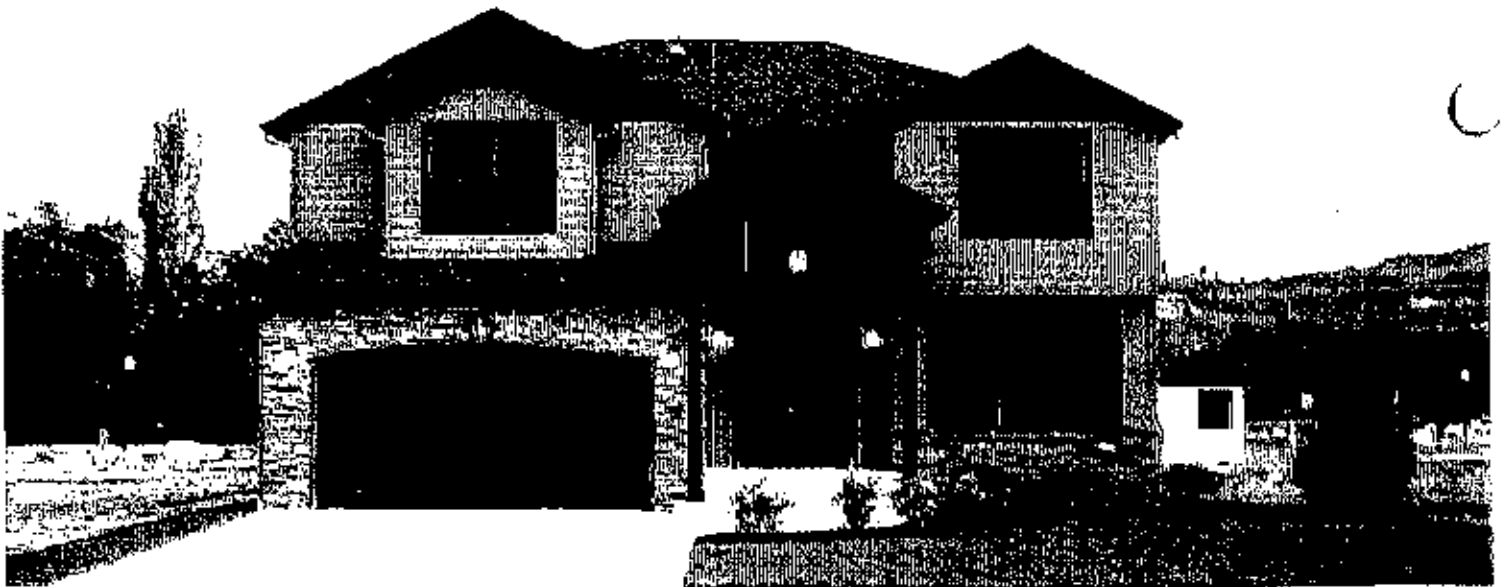
FRONT VIEW 12/13/2007