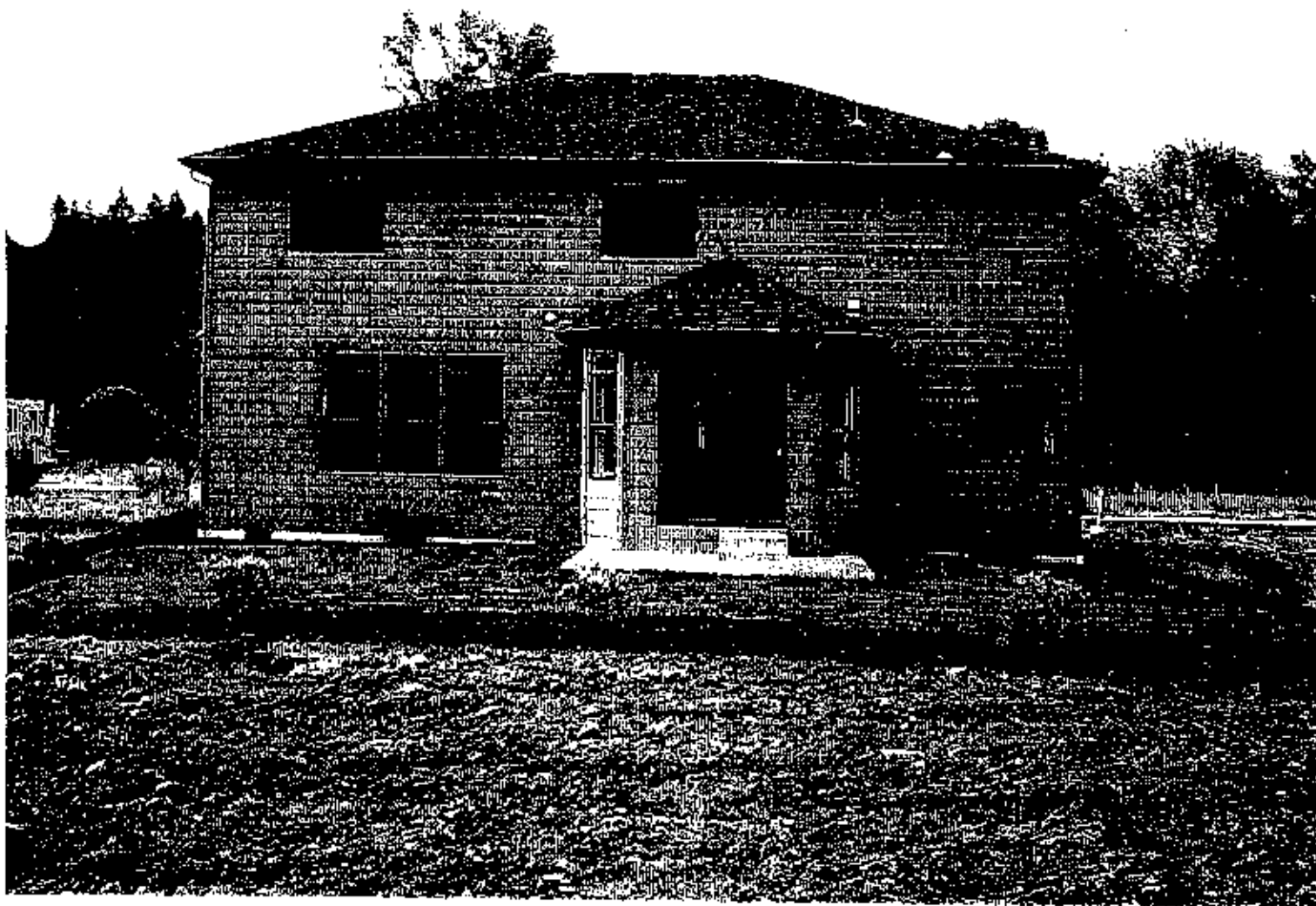
REAR VIEW 06/13/2007

If submitting more photographs than will fit on the preceding page, affix the additional photographs below. Identify all photographs with: date taken; "Front View" and "Rear View"; and, if required, "Right Side View" and "Left Side View."