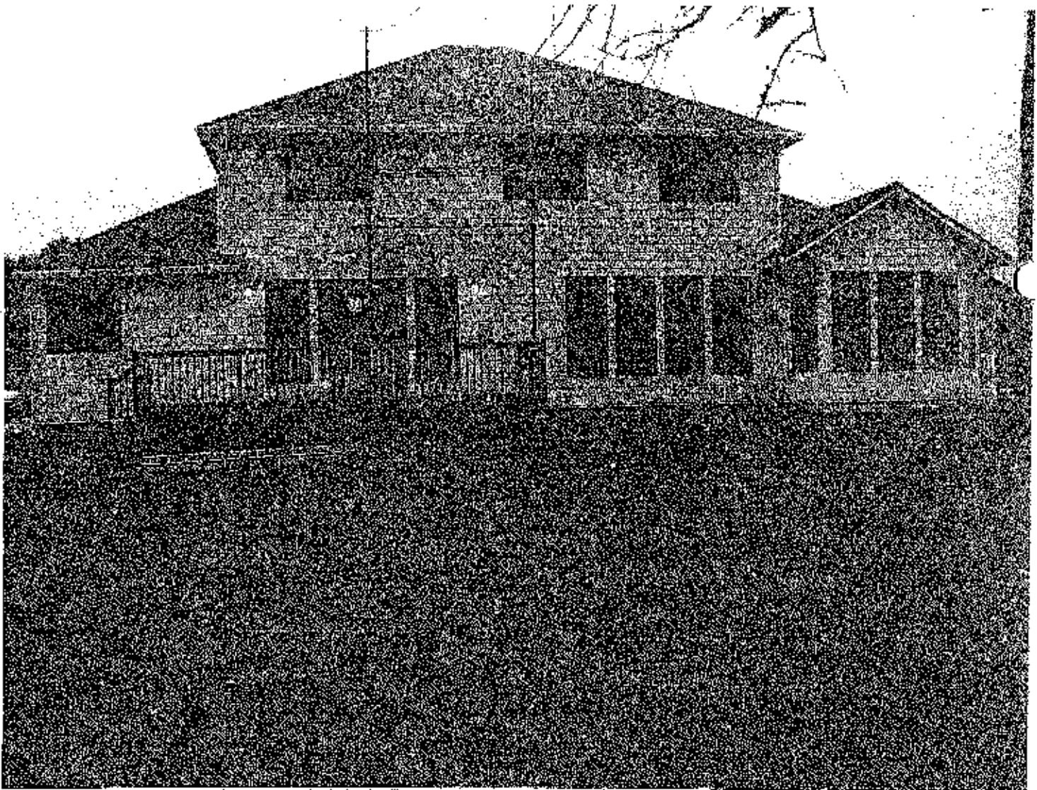
REAR VIEW 11/19/07