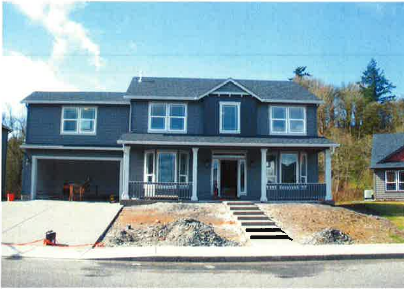
REAR VIEW 04/21/14