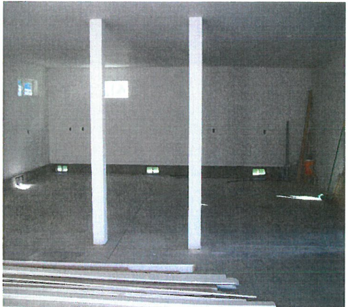
Inside Garage under Main Living area