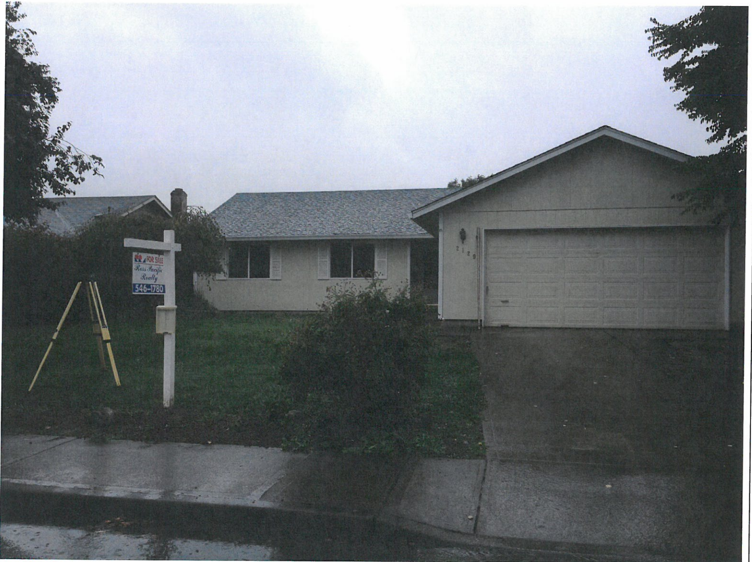
FRONT VIEW LOOKING SOUTH SEPTEMBER 27, 2013

If using the Elevation Certificate to obtain NFIP flood insurance, affix at least 2 building photographs below according to the instructions for Item A6. Identify all photographs with date taken; "Front View" and "Rear View"; and, if required, "Right Side View" and "Left Side View." When applicable, photographs must show the foundation with representative examples of the flood openings or vents, as indicated in Section A8. If submitting more photographs than will fit on this page, use the Continuation Page.