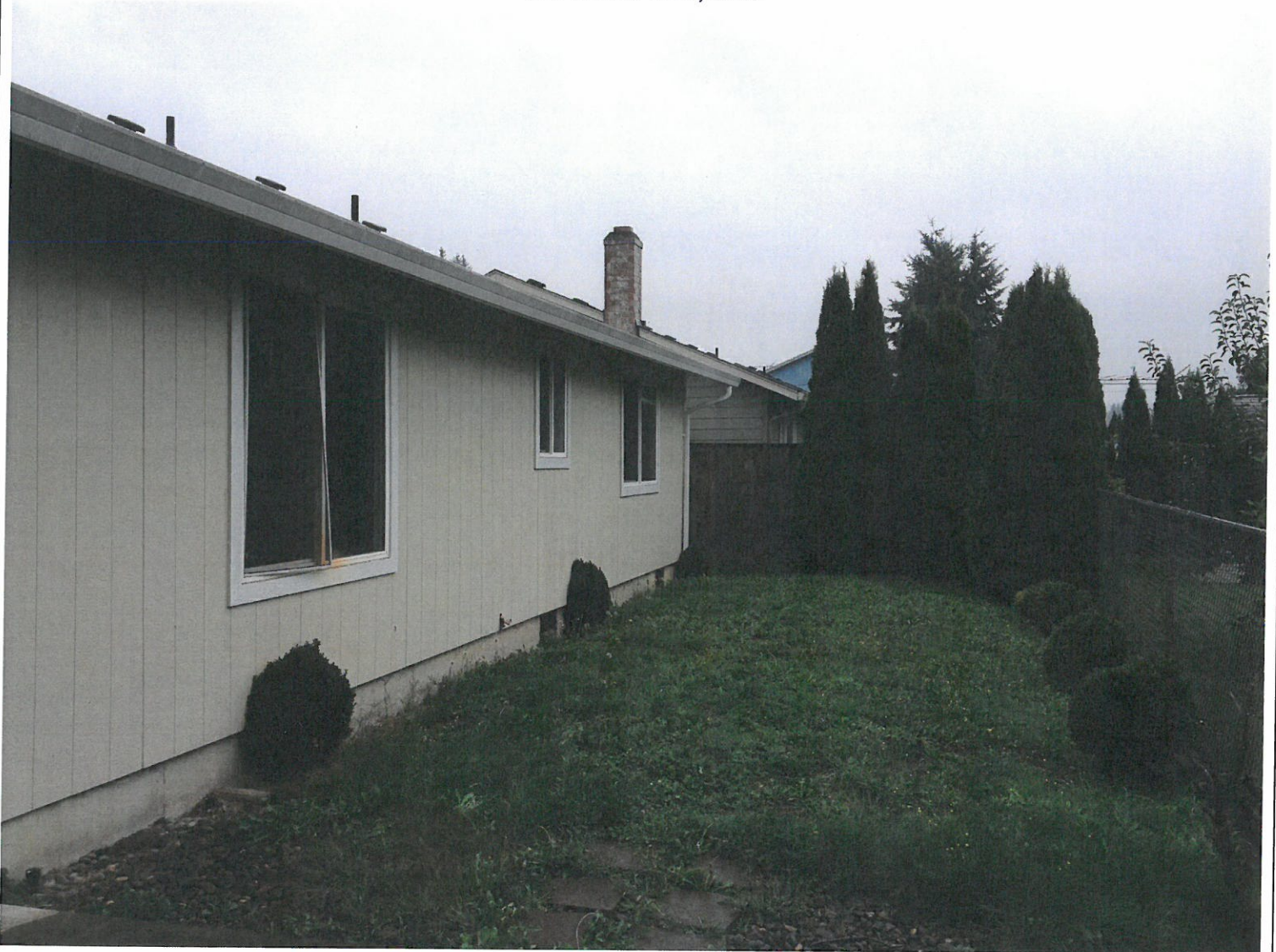
REAR VIEW LOOKING EAST SEPTEMBER 27, 2013

If submitting more photographs than will fit on the preceding page, affix the additional photographs below. Identify all photographs with: date taken; "Front View" and "Rear View"; and, if required, "Right Side View" and "Left Side View." When applicable, photographs must show the foundation with representative examples of the flood openings or vents, as indicated in Section A8.