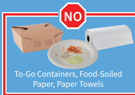
To-Go Containers, Food-Soiled Paper, Paper Towels