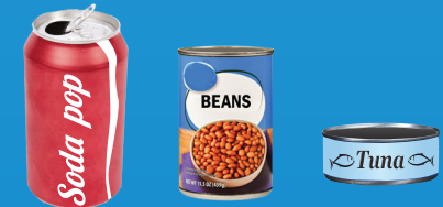
Aluminum, Steel, Tin Cans