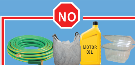
Hoses, Stretchy Plastic, Chemicals, Plastic Clamshells