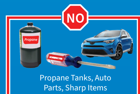
Propane Tanks, Auto Parts, Sharp Items